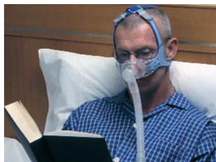
The Mirage Vista Nasal Mask allows patients to follow their normal bedtime routines prior to sleep