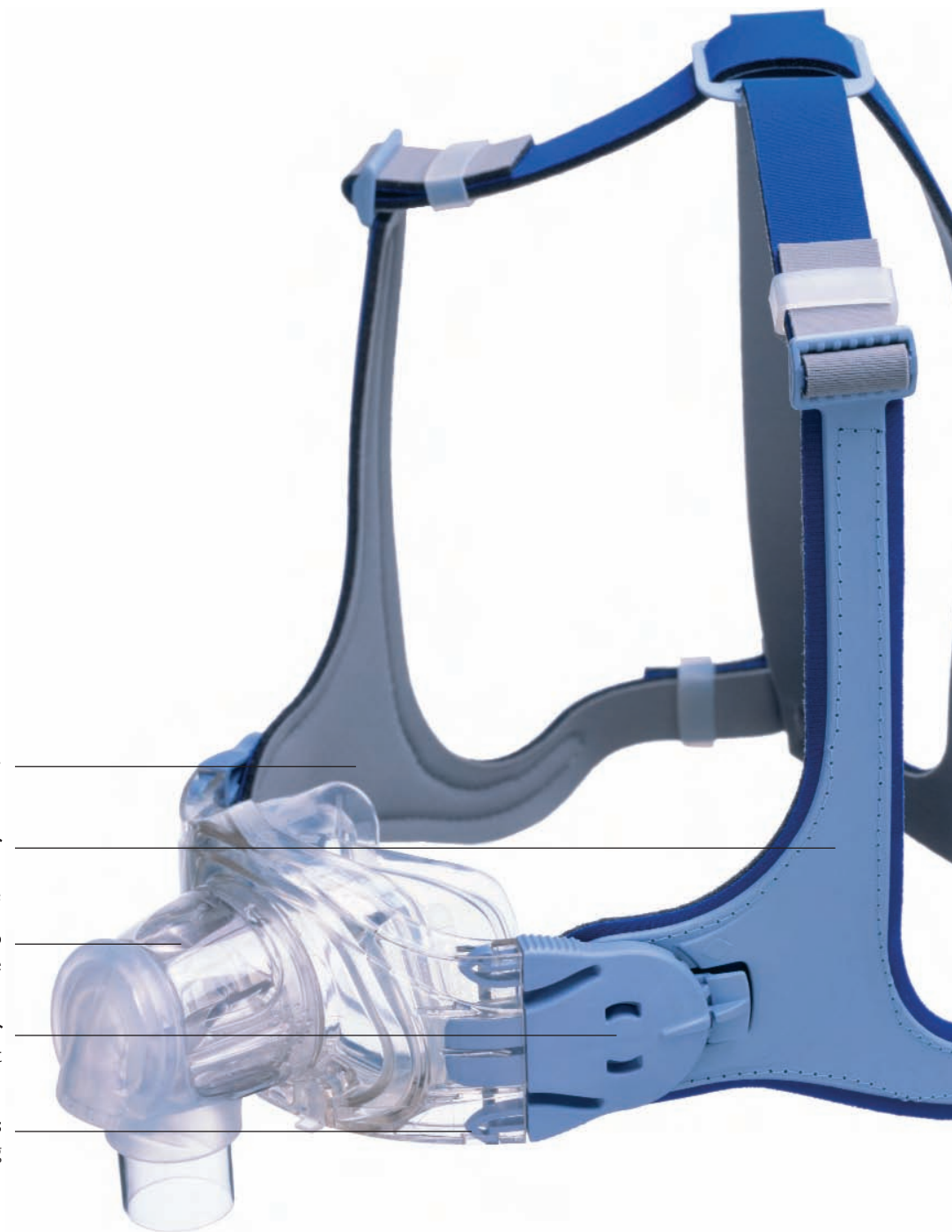
Mirage Vista Nasal Mask

The Mirage Vista uses the proven and popular ResMed Mirage™ cushion technology. This, together with unique headgear, ensures stability and seal with long-term comfort.