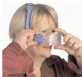
Easy-lock parts—easier handling