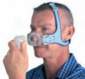
Elbow clip—easy and convenient