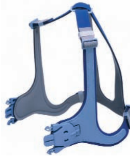
Headgear—no readjustment needed